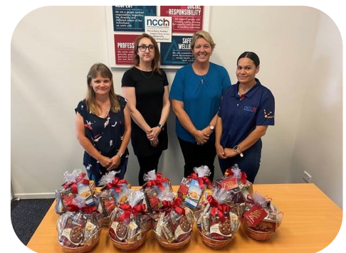
Some of our Grafton Team with Christmas Hamper donations for tenants