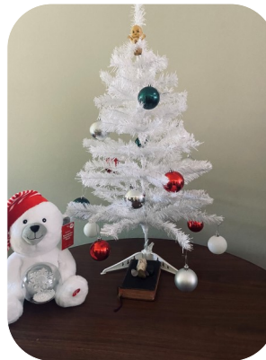
One of the donated Christmas Trees for our Together Home Tenants