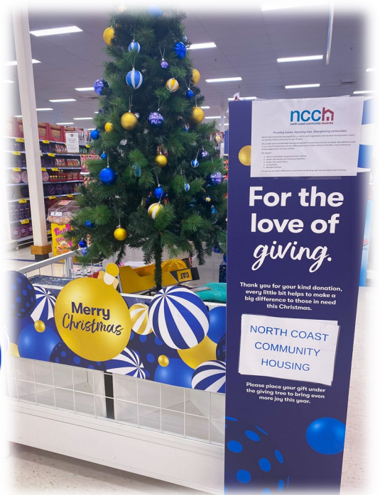
The NCCH & Big W Giving Tree

NCCH would like to thank the Big W Lismore Team for their generous support in making our tenants' Christmas a little brighter this year.